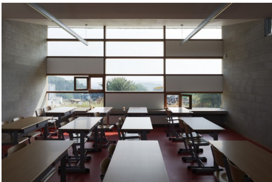
Â© Alain Janssens