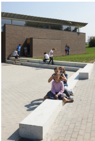
Â© Alain Janssens