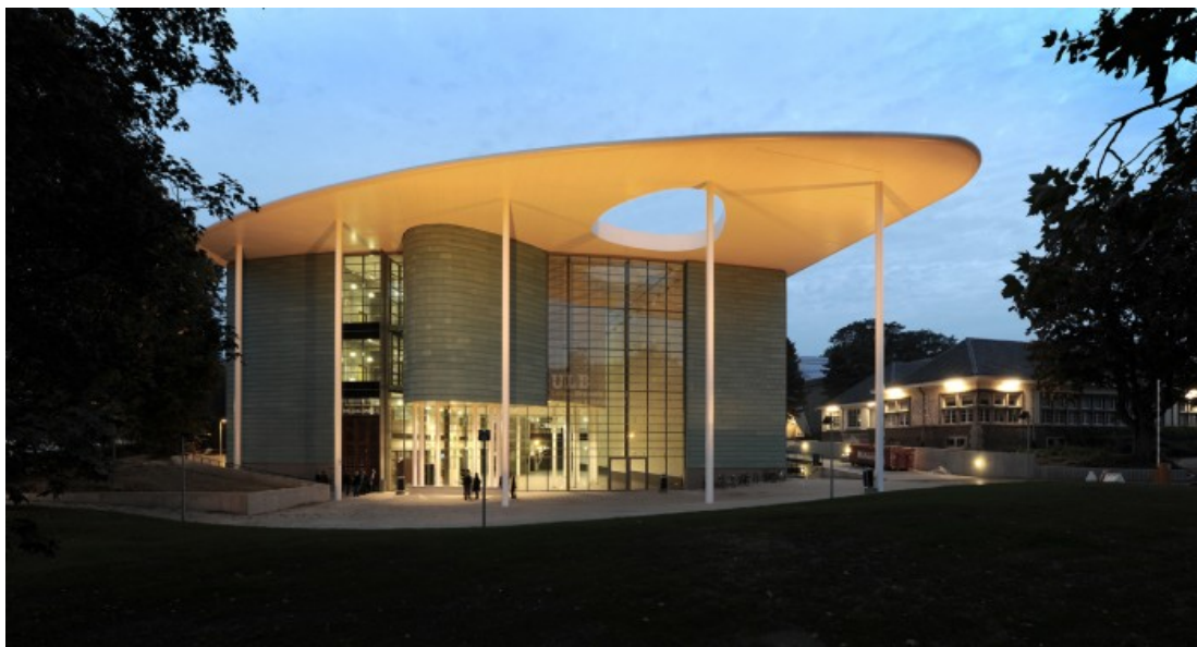
Â© Serge Brison