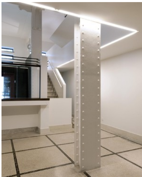
recovered the old staircase for access to the gateway