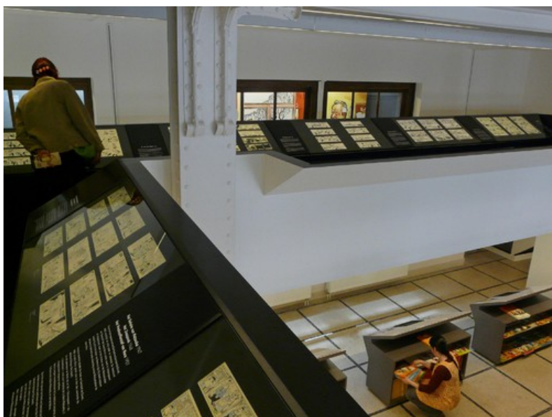
the bridge with the original drawings of Marc Sleen exposed