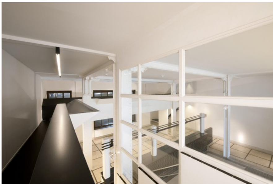
general view from the gateway