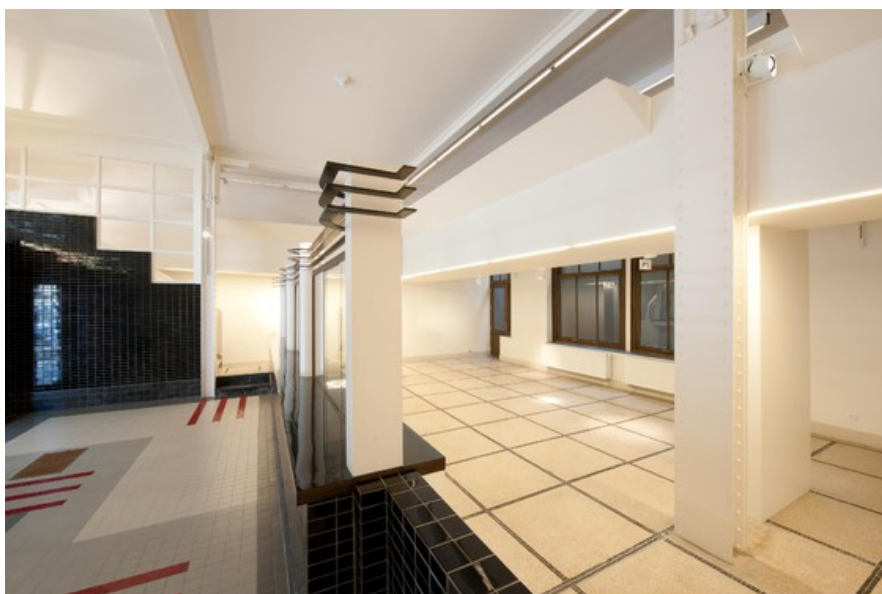
general view from the ground floor