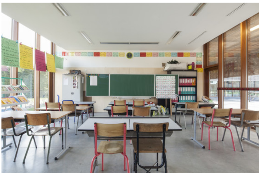
Â© Tim Van de Velde