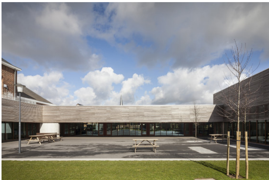
Â© Tim Van de Velde