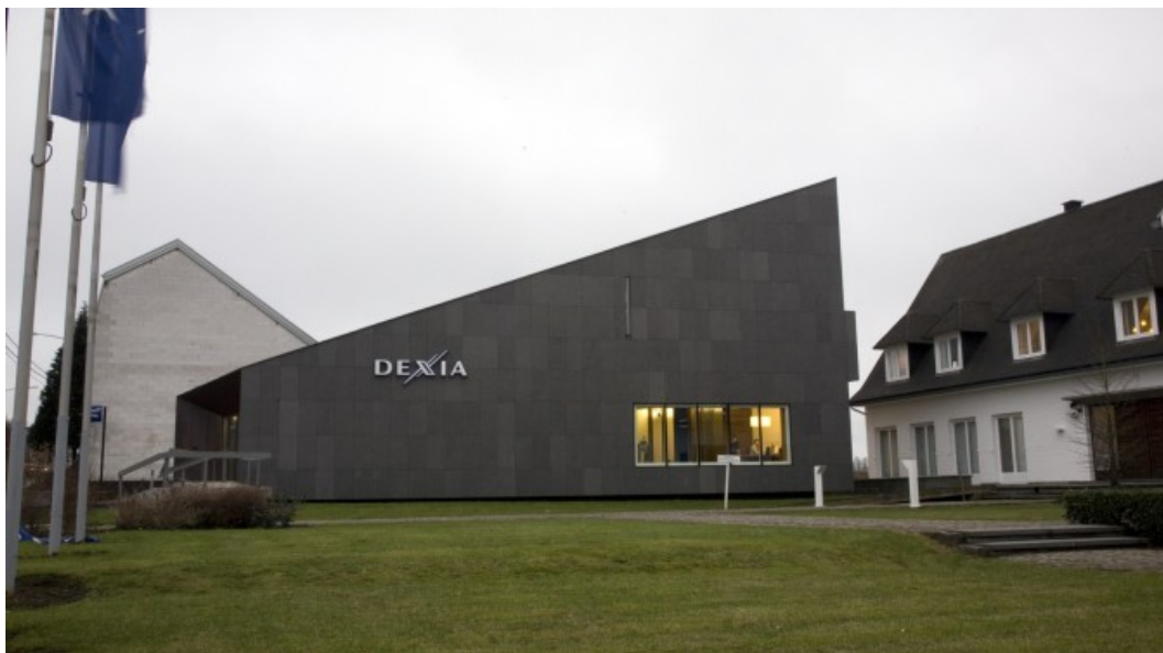
Â© Atelier d'architecture Pierre Hebbelinck & Pierre de Wit