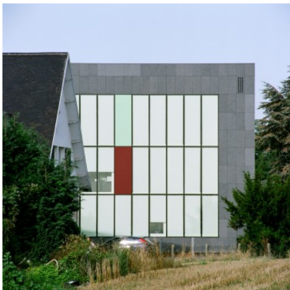
Â© Atelier dâ™ architecture Pierre Hebbelinck & Pierre de Wit