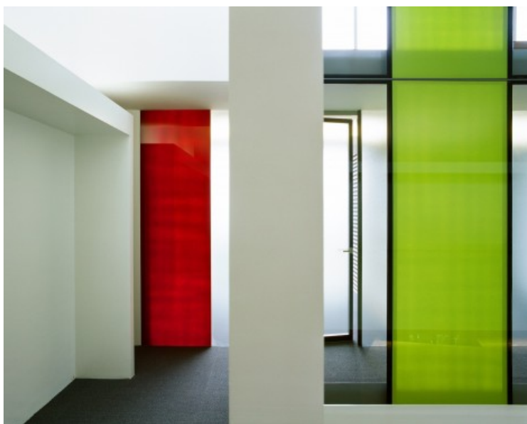
Â© Atelier dâ™ architecture Pierre Hebbelinck & Pierre de Wit