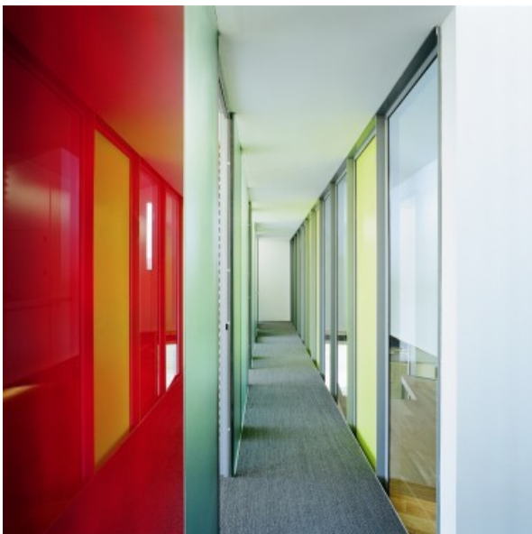
Â© Marie-Françoise Plissart

Theater, L'Emulation - 2008 2013 - Liège