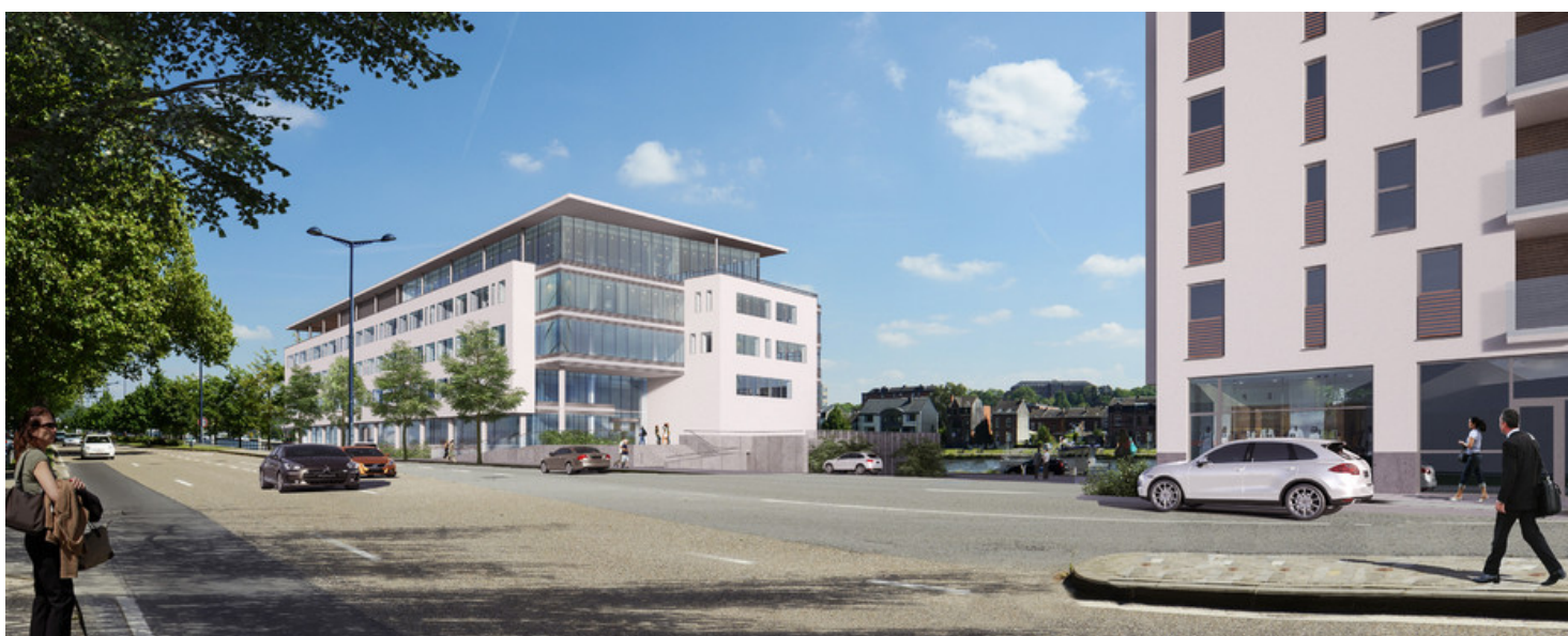
Â© Atelier de l'Arbre d'Or sa