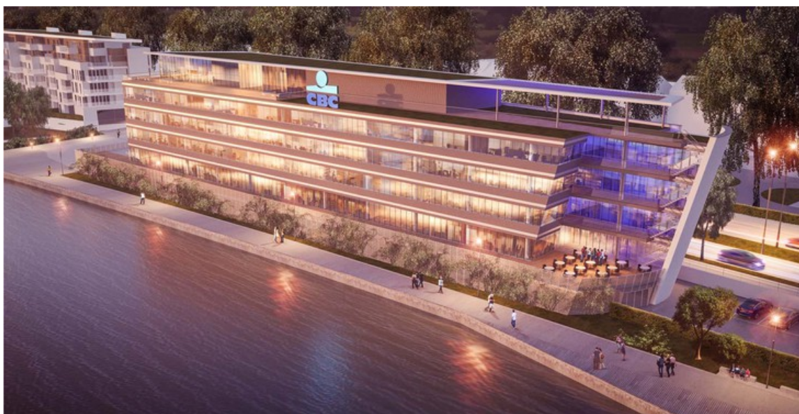
Â© Atelier de l'Arbre d'Or sa