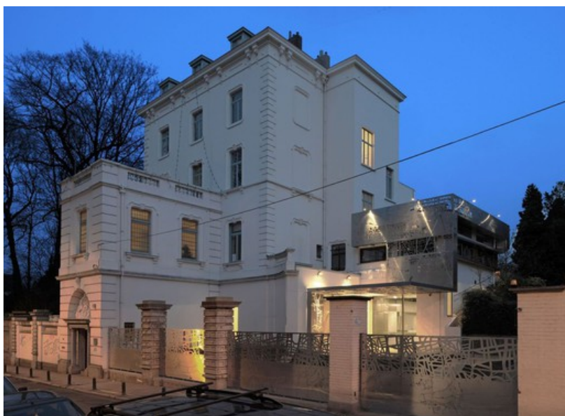
Â© B612 associates