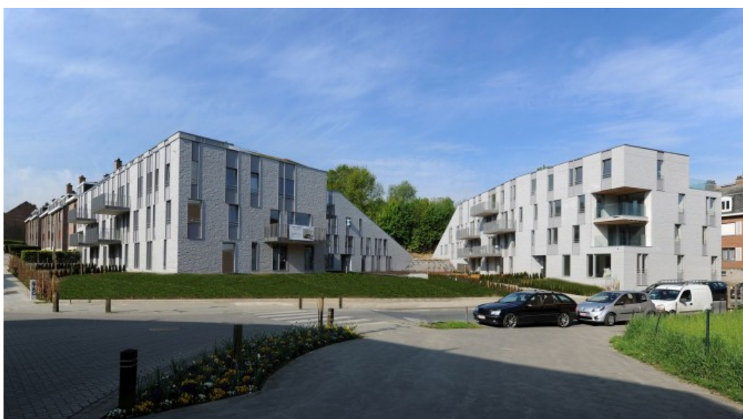
Â© B612 associates