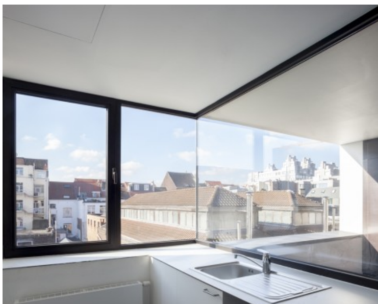
Â© Tim Van de Velde