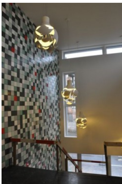
Â© CERAU Architects Partners