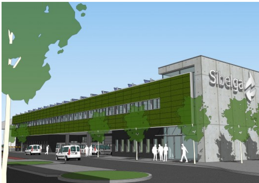
View of the main facade vegetated Â© CERAU Architects Partners