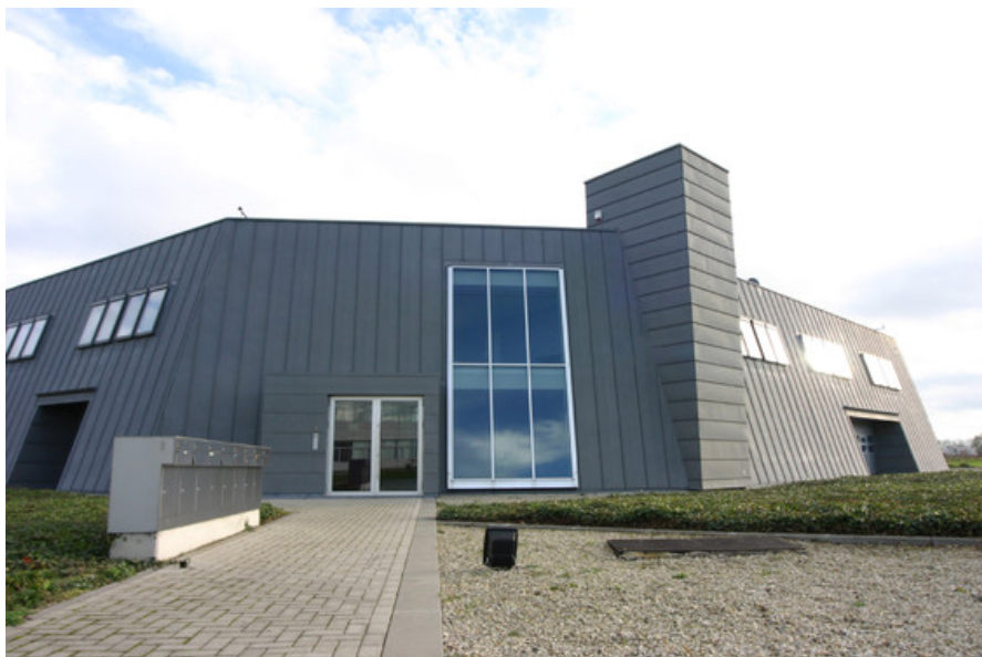
Â© Cathy Suinen