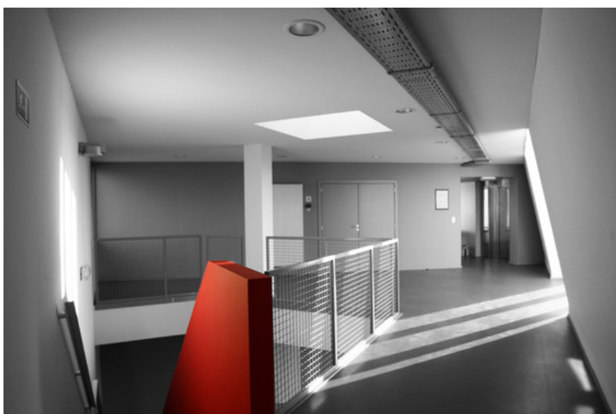
Â© Cathy Suinen