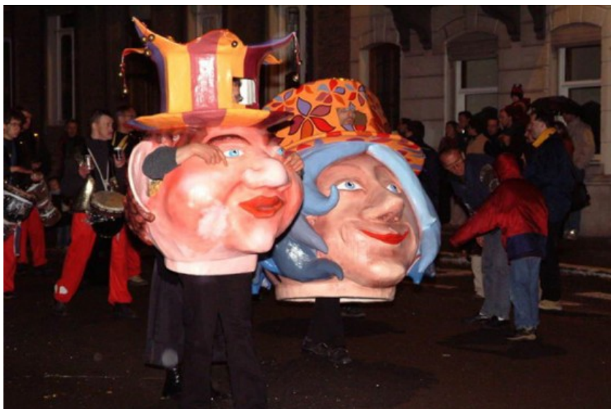
Local festival: the "Simpelourd"