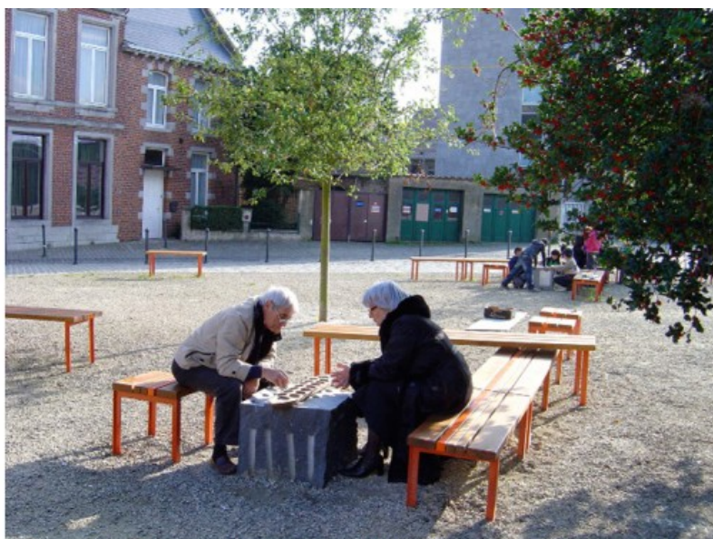
Domitienne Cuvelier invested the new square with street games and landscape elements. Â© Domitienne Cuvelier