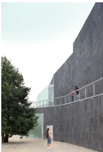
Â© Filip Dujardin