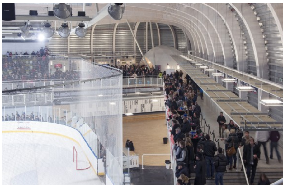
Â© L'Escout Architectures