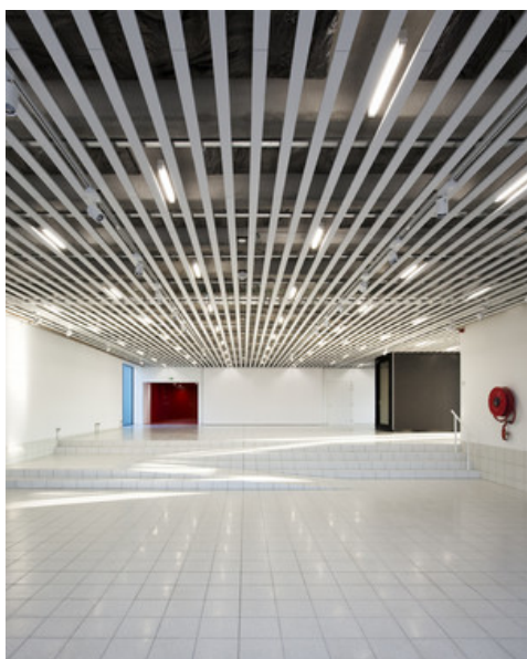
Exhibiting space