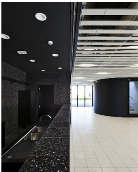
From the bar to the entrance