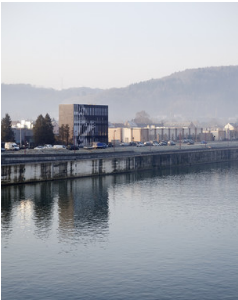
From the Meuse's bridge