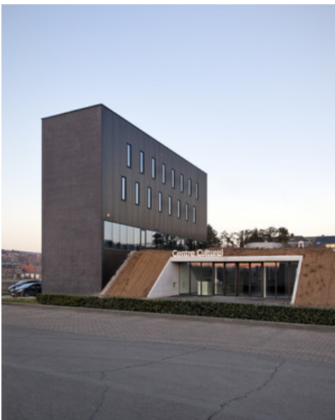
The Entrance of the Cultural center