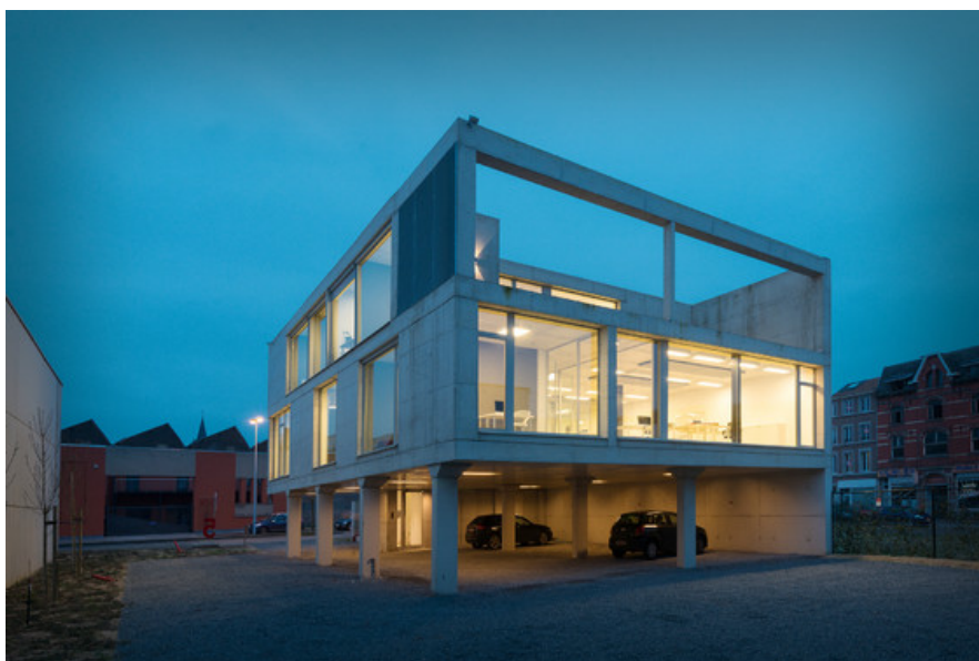
ANTHE - Office