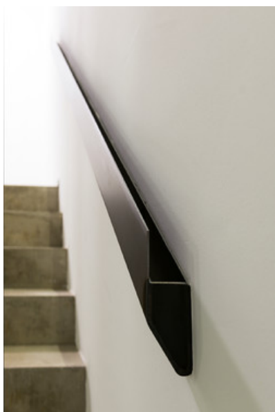
ANTHE - Office