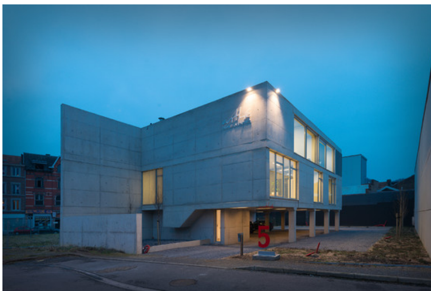
ANTHE - Office