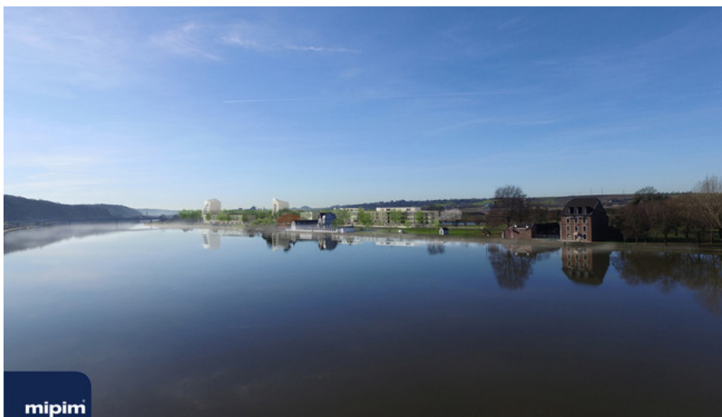
MEUSE VIEW - Real estate