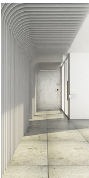
MEUSE VIEW - Entry Â© Luc Spits