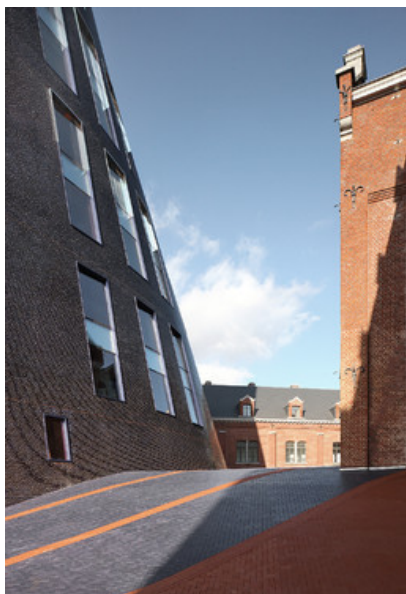
Â© Filip Dujardin