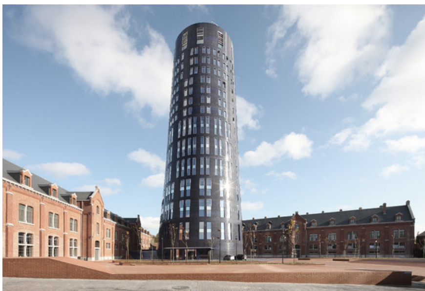
Â© Filip Dujardin