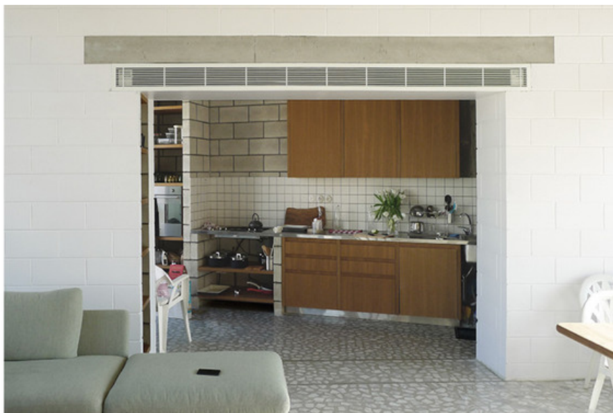
Â© NOTAN office