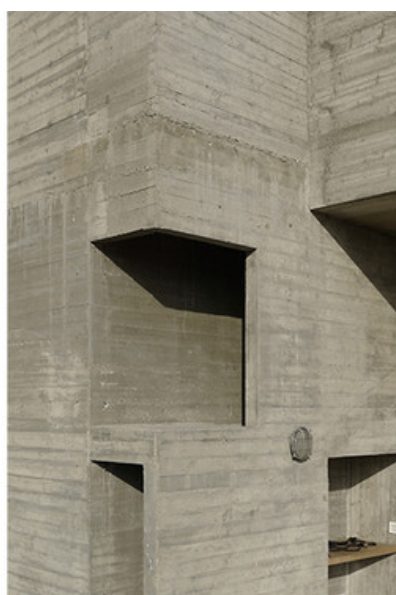
Â© NOTAN office