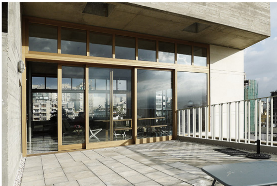
Â© NOTAN office