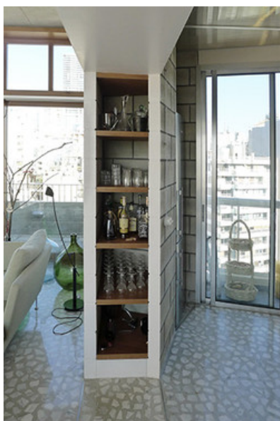
Â© NOTAN office