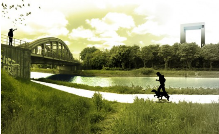
Â© RESERVOIR A - ARCHITECTES