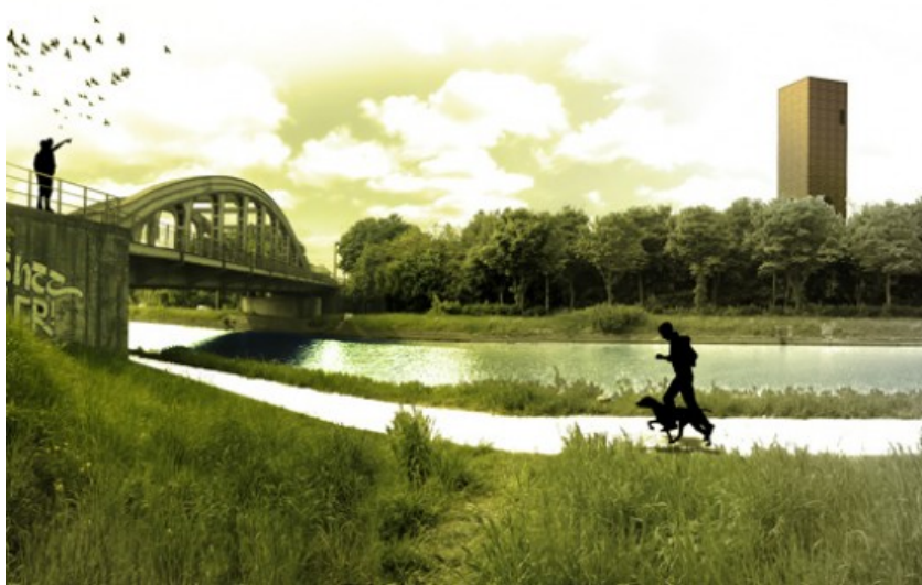
Â© RESERVOIR A - ARCHITECTES