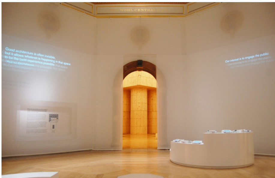
Central Hall, SHSH