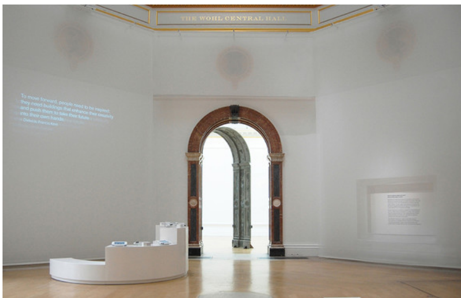
Central Hall, SHSH