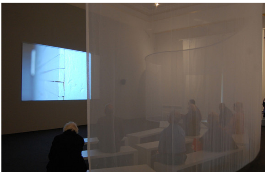
Film Hall, SHSH