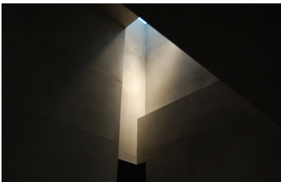
Grafton Architects Installation Â© SHSH