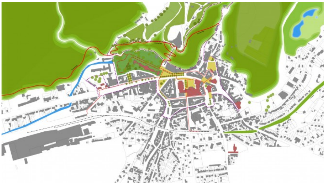
Thermal walk © Drawing by Sum