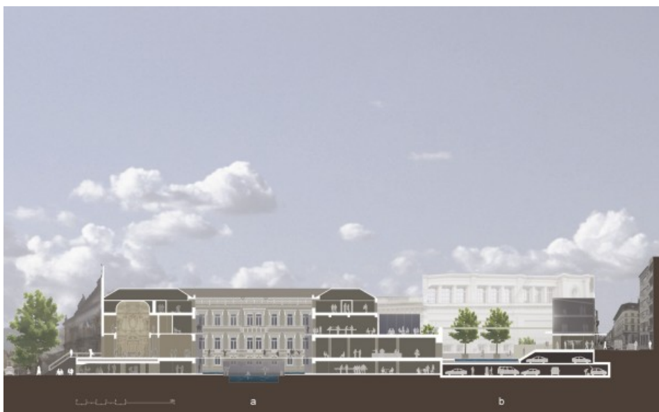
Longitudinal section © Drawing by Sum & Barbara Van der Wee Architects