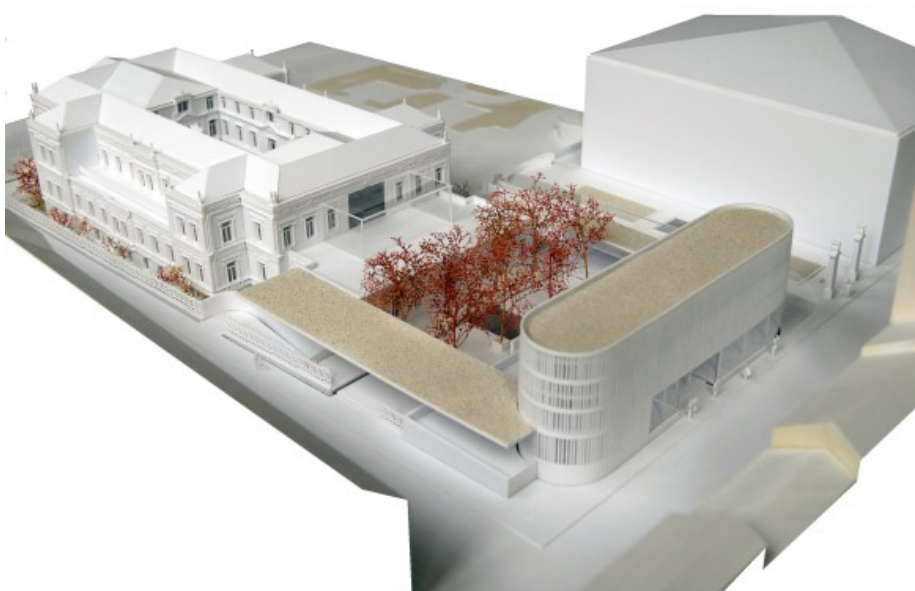
Model - back façade