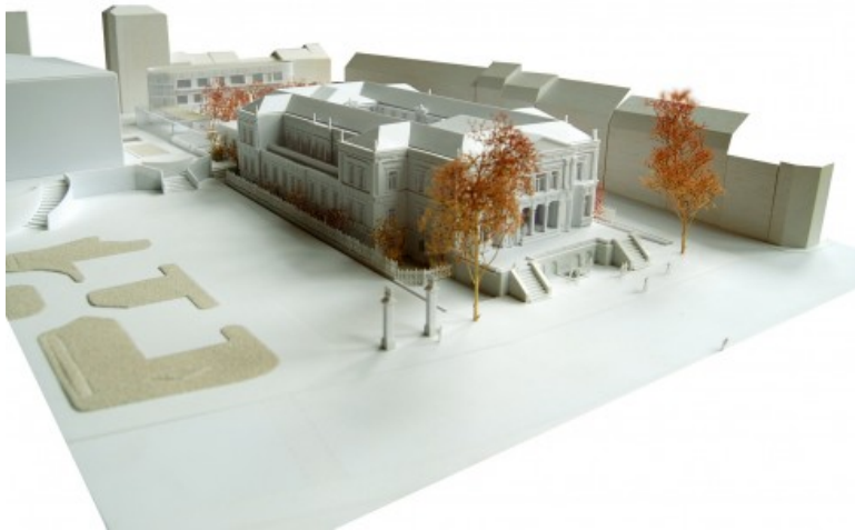
Model - front facade