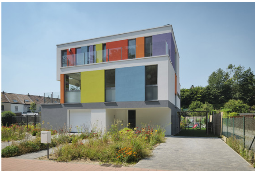
Â© atelier d'architecture FORMa*