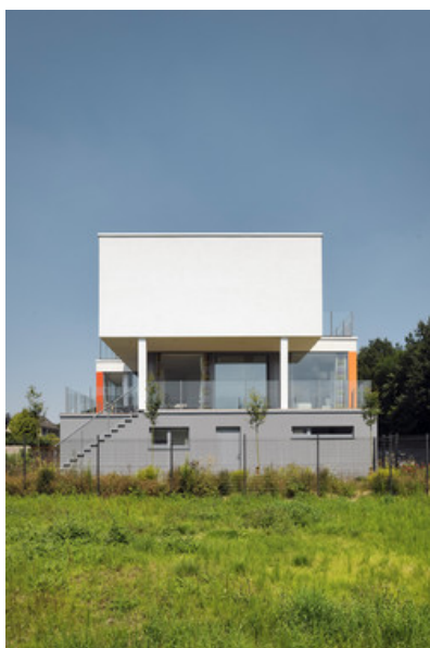
Â© atelier d'architecture FORMa*