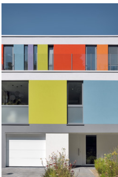
Â© atelier d'architecture FORMa*