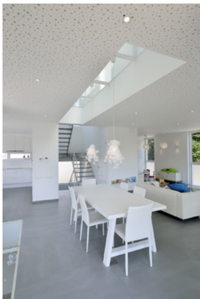
Â© atelier d'architecture FORMa*