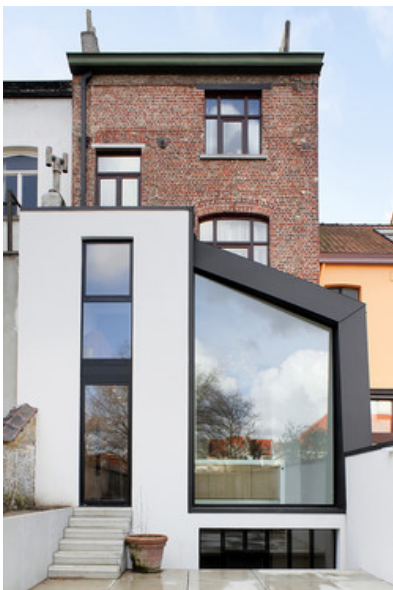
Â© ici architectes