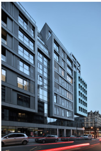
Â© Georges de Kinder