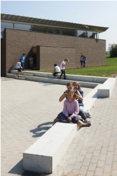
Â© Alain Janssens