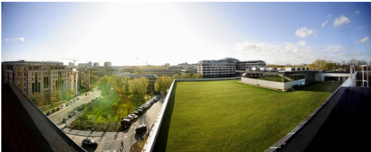
Â© AWAA for cwarchitectes