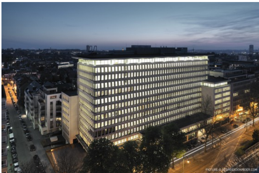
Â© Georges de Kinder