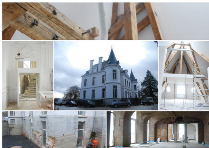
Castle of Chevetogne - Evolution