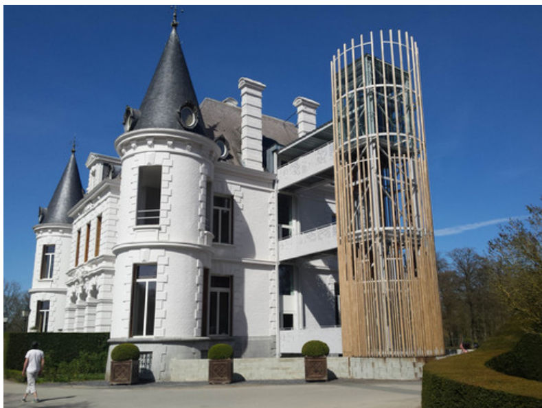
Castle of Chevetogne - Green tower Â© Atelier Chora