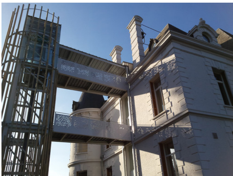
Castle of Chevetogne - Footbridge