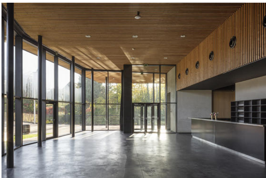
Inside view