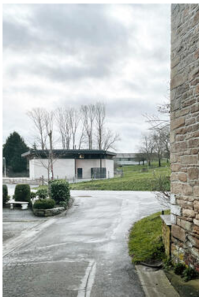
View from the village