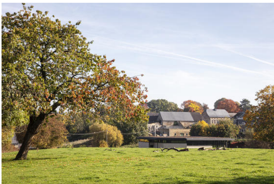
View from the country field