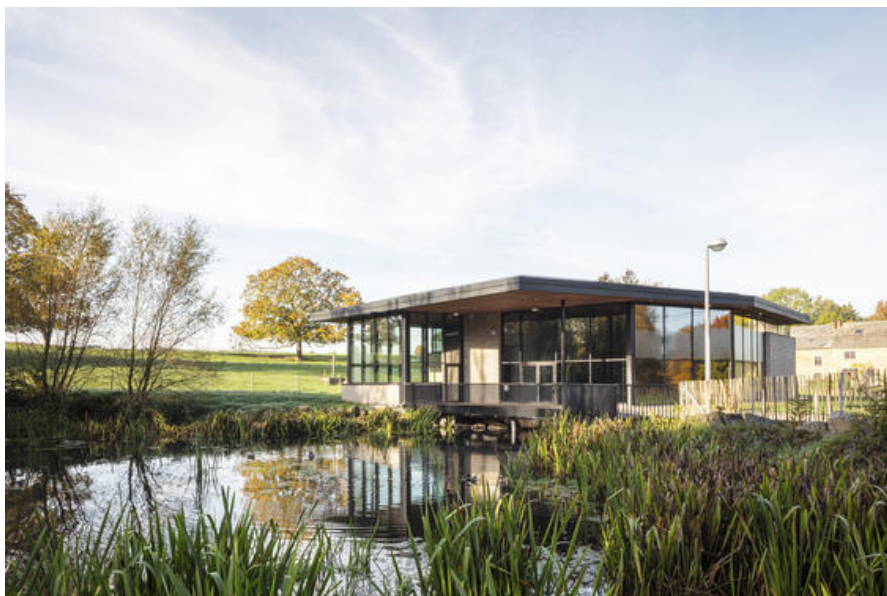
View from the pond