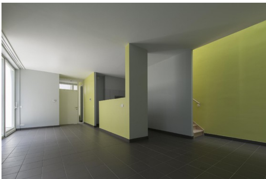
a space for open and generous living