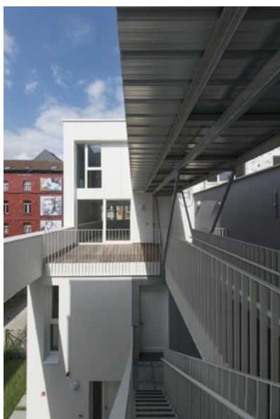
outside stairs and walkways are meeting places