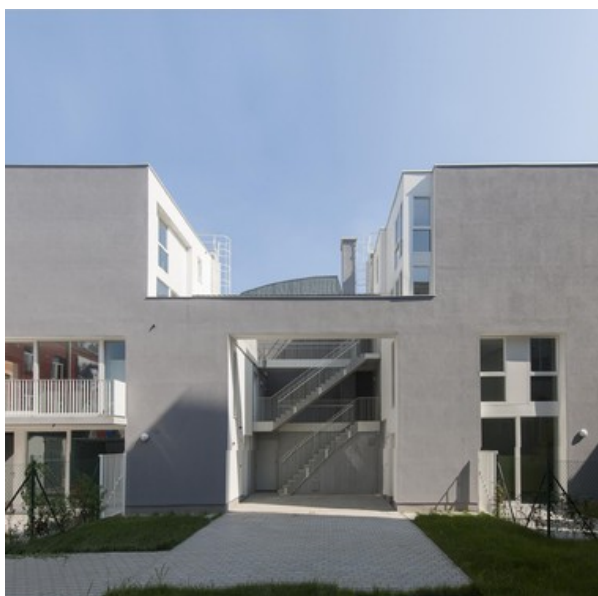
outside stairway splits the building into two volumes