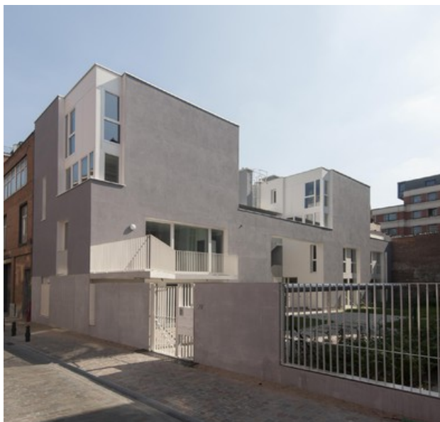
the building stretches along the terraced to provide an opening to the street