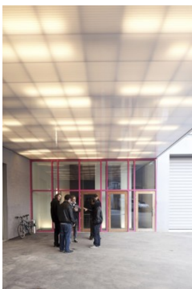
Â© Fabian Rouwette