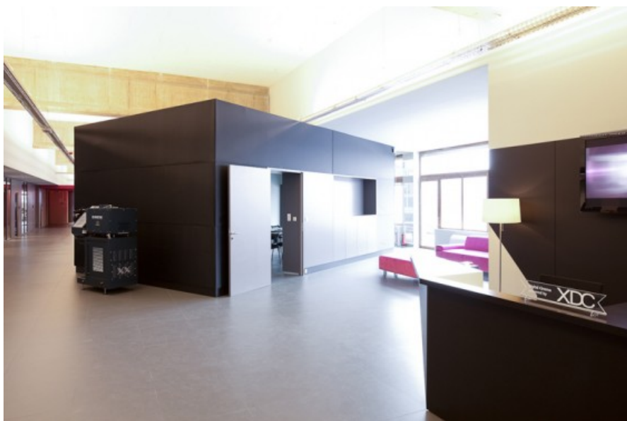
Â© Atelier d'Architecture AIUD