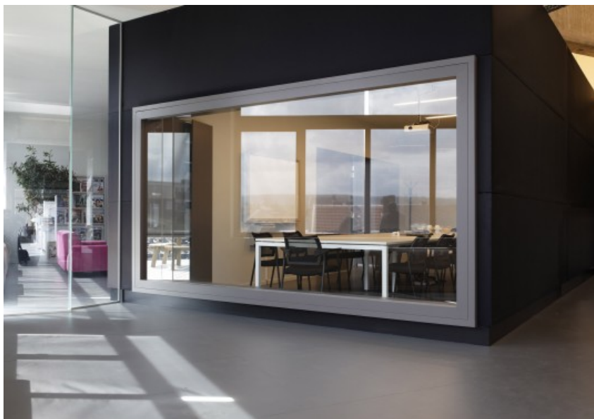
Â© Atelier d'Architecture AIUD