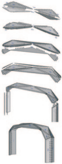
Axonometry of the principe of assembly Â© IBOIS