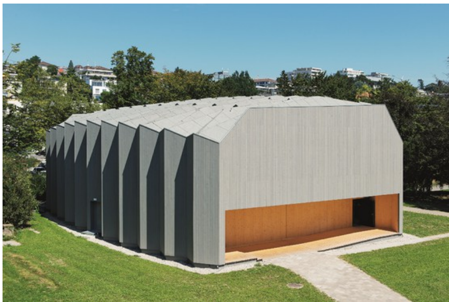
Timber Pavilion of the Vidy-Lausanne Theatre