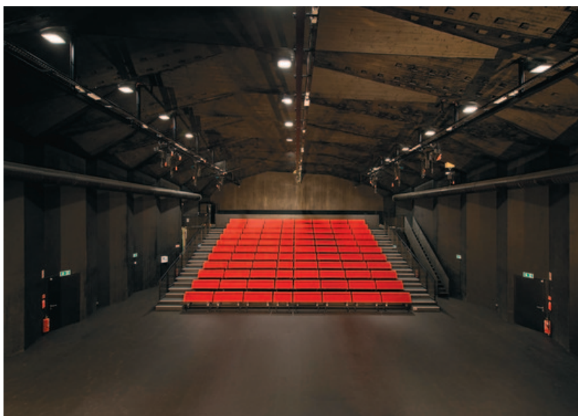
Timber Pavilion of the Vidy-Lausanne Theatre