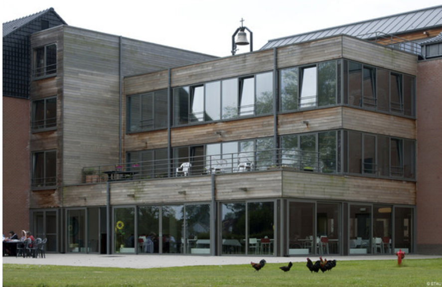
VERTEFEUILLE - nursing home Â© ETAU