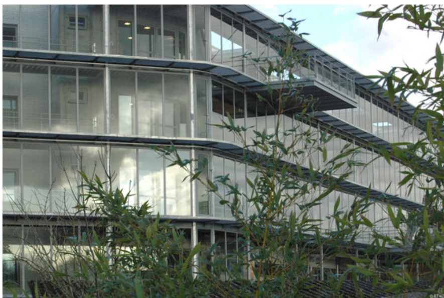
VERTEFEUILLE - assisted living residence