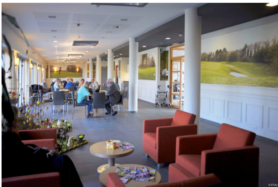
VERTEFEUILLE - assisted living residence