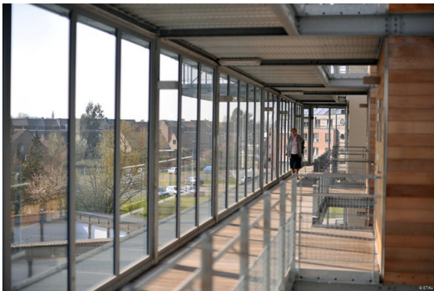
VERTEFEUILLE - assisted living residence