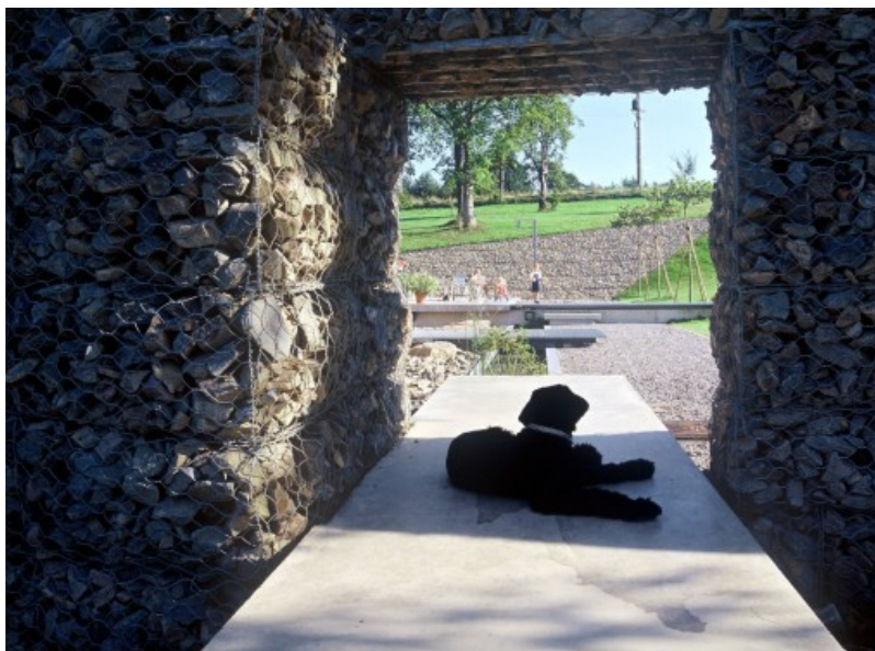
Â© this is a landscaping project fot the exterior of a