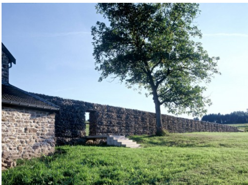
Â© this is a landscaping project fot the exterior of a