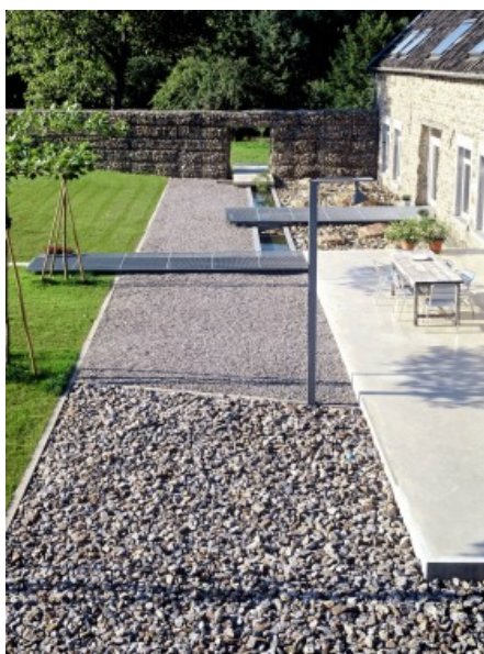
Â© this is a landscaping project fot the exterior of a