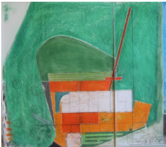
Â© Georges-Éric Lantair