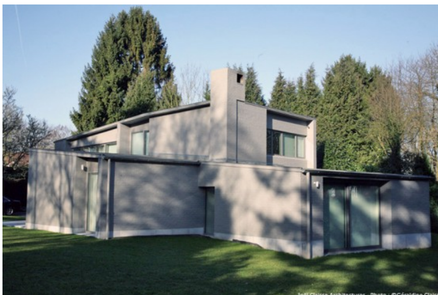
View of the new extension. Â© G  raldine Claisse