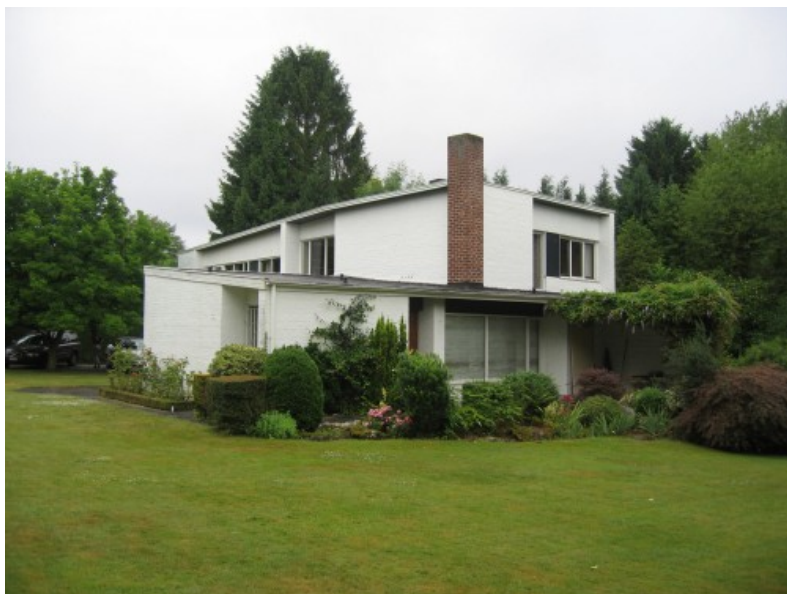
View of the original situation. © Joël Claisse Architectures