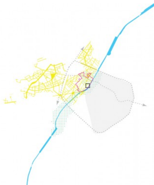
Yellow: Molenbeek (1080 Brussels), Pink: District contract Cinéma - Belle-Vue, Green: "zone levier". Â© L'Escaut