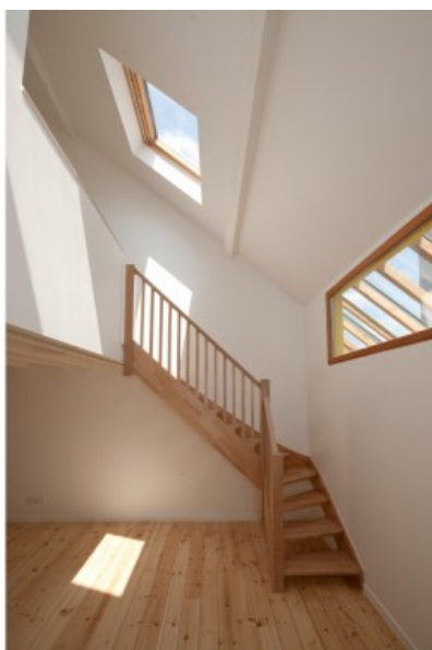
Â© Marc Detiffe