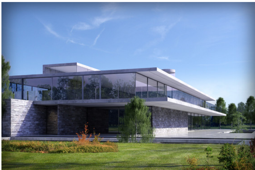
FICO - Wellness