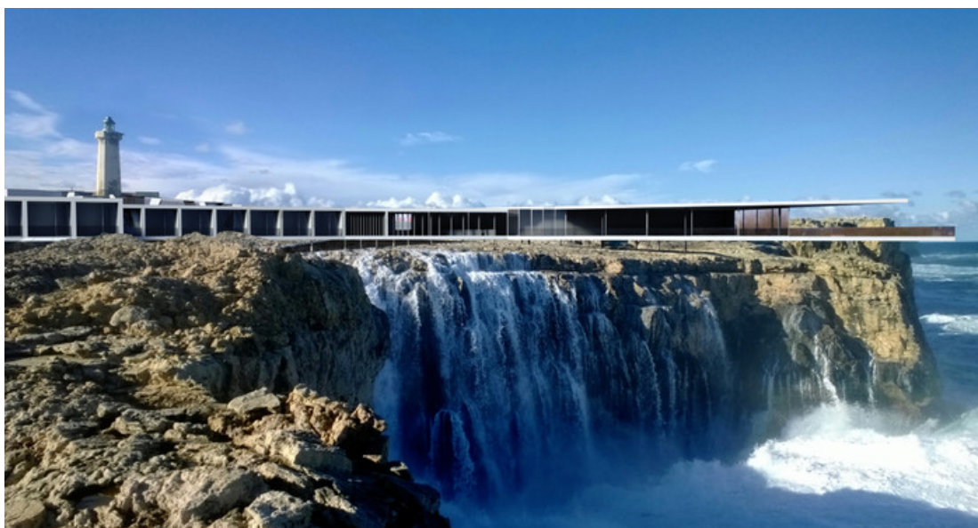
LIGHTHOUSE SEA HOTEL - Hotel and wellness