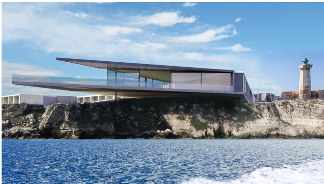
LIGHTHOUSE SEA HOTEL - Hotel and wellness