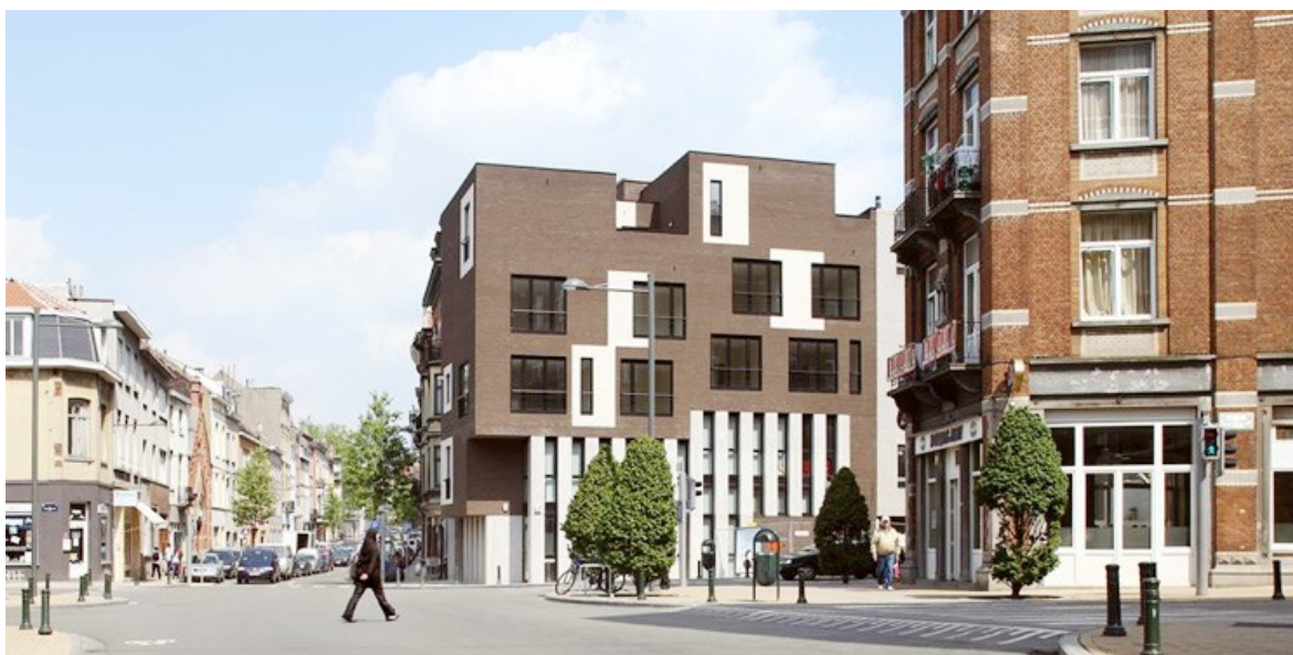
Â© ARJM architecture et urbanisme