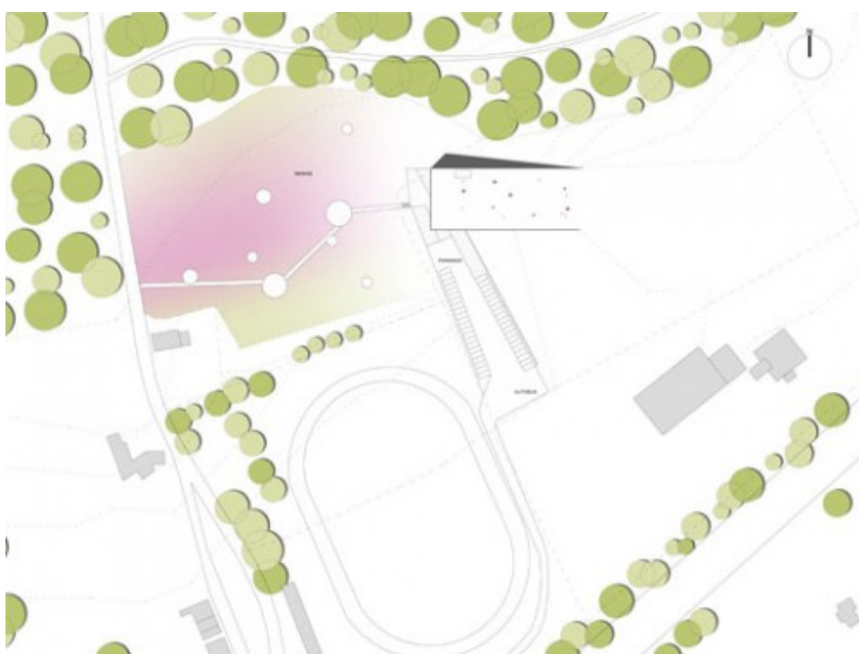
Â© RESERVOIR A - ARCHITECTES