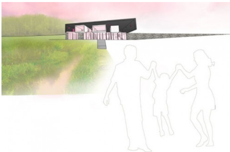
Â© RESERVOIR A - ARCHITECTES