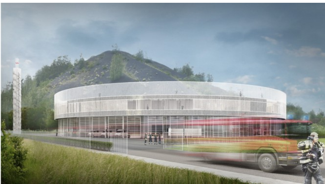
Â© RESERVOIR A