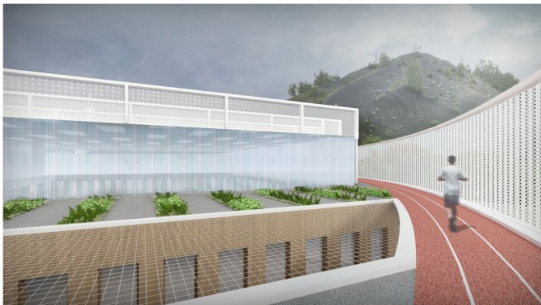
Â© RESERVOIR A