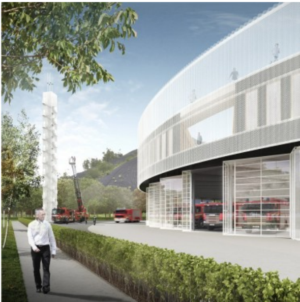
Â© RESERVOIR A