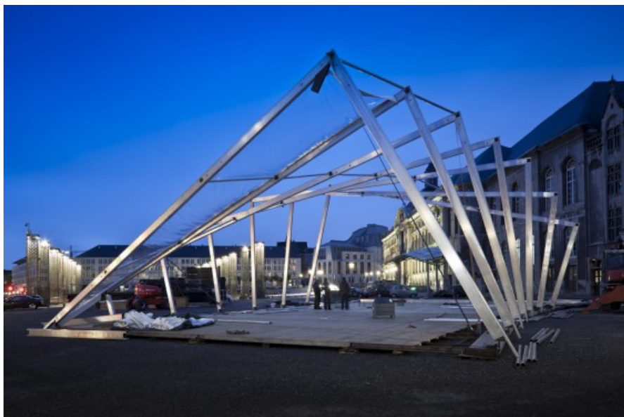
Â© S2JD architectes