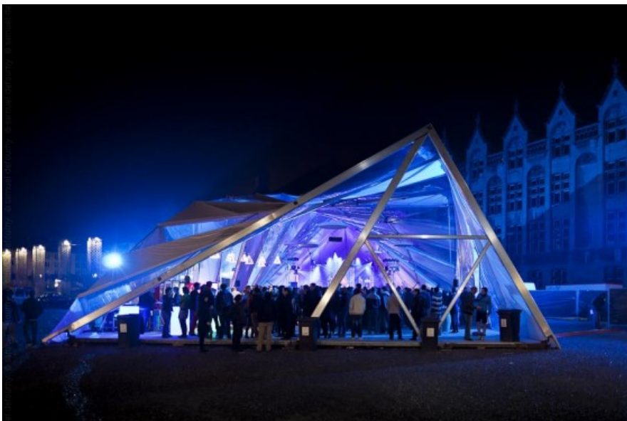
Â© S2JD architectes