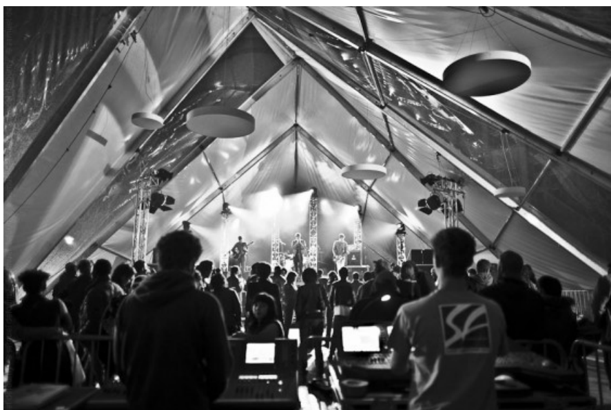
Â© S2JD architectes