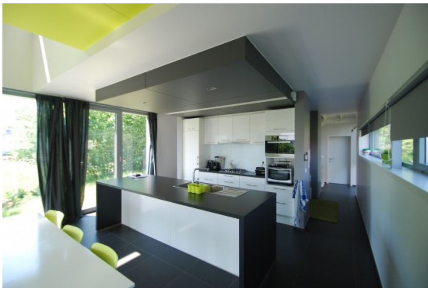
Â© SECHEHAYE Architecture & Design