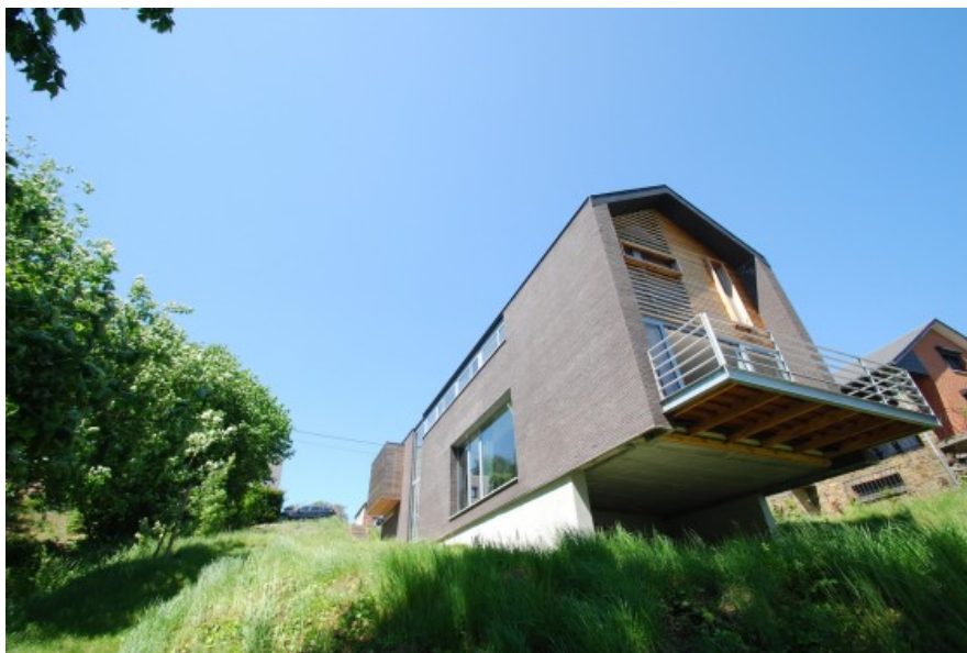
Â© SECHEHAYE Architecture & Design