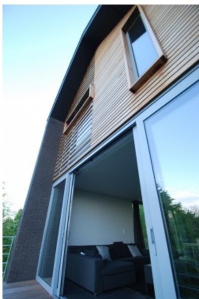
Â© SECHEHAYE Architecture & Design