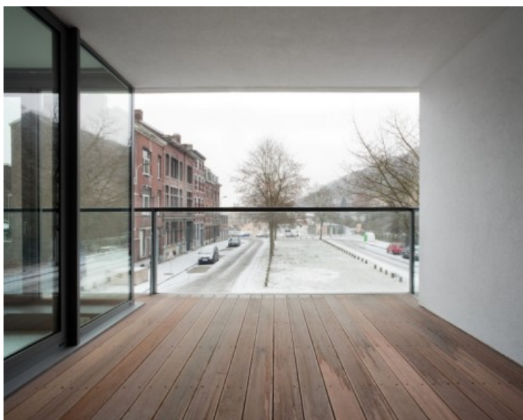
View from Patio