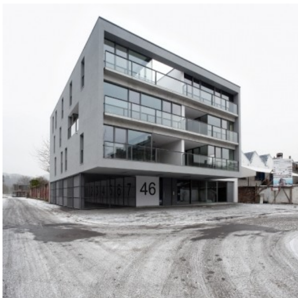
Global view