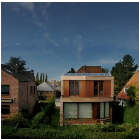
Â© V2W Architectes sprl