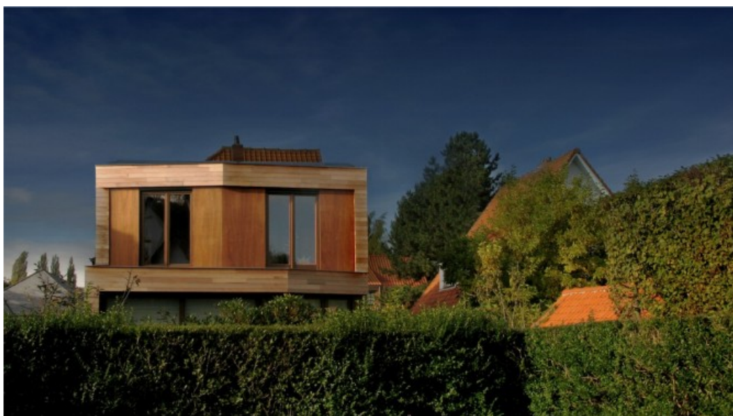
Â© V2W Architectes sprl