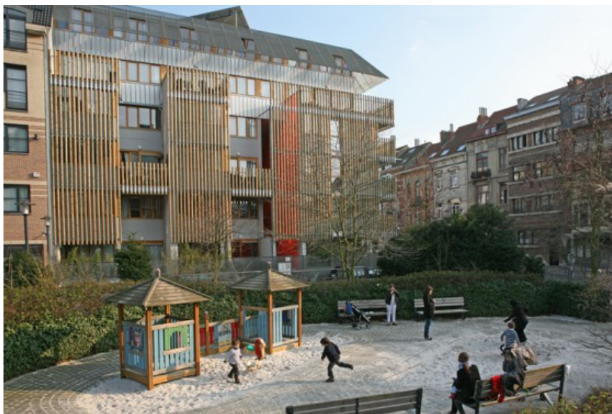
Â© Michel Vanden Eeckhoudt