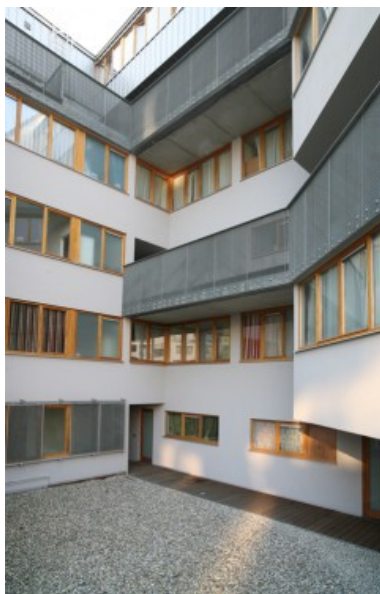
Â© Michel Vanden Eeckhoudt