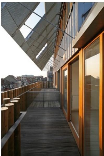
Â© Michel Vanden Eeckhoudt