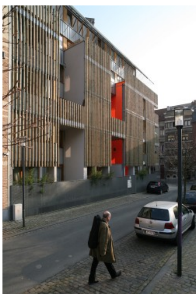
Â© Michel Vanden Eeckhoudt