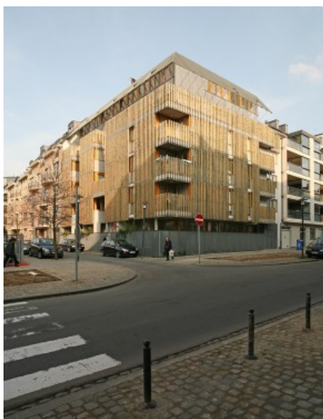
Â© Michel Vanden Eeckhoudt