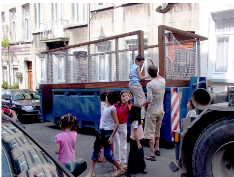
Â© WHY architecture