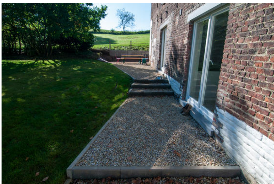
Â© MT4 Architects