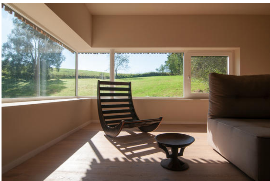
Â© MT4 Architects