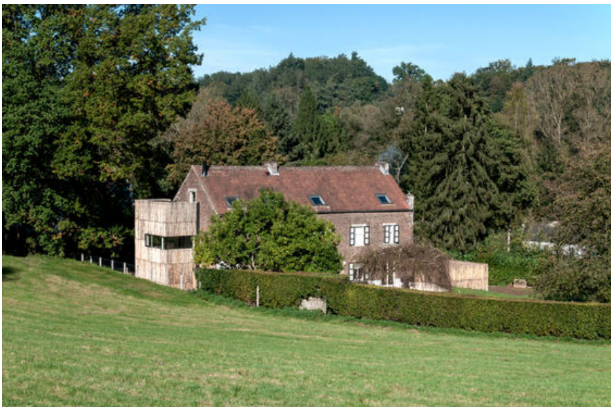
Â© MT4 Architects

Minerve_Rénovation/extension of two apartments - 2019 2020 - Bruxelles