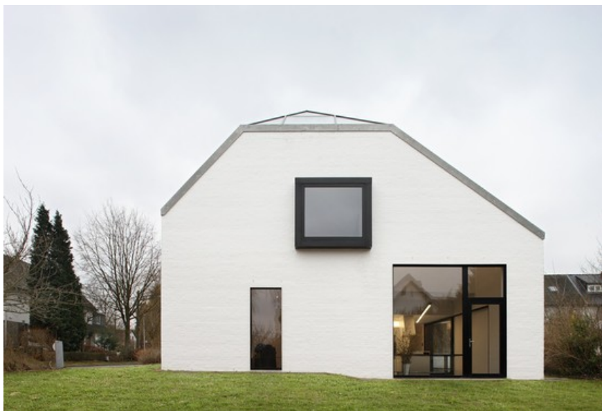
Â© Filip Dujardin