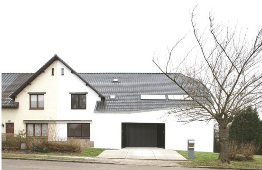
Â© Filip Dujardin