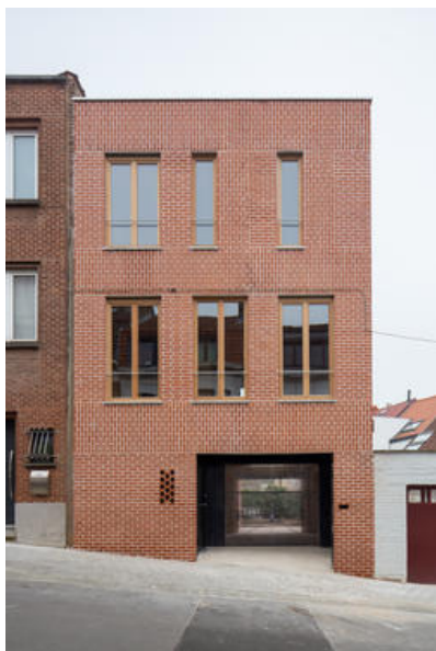
Â© SÃ©verin Malaud